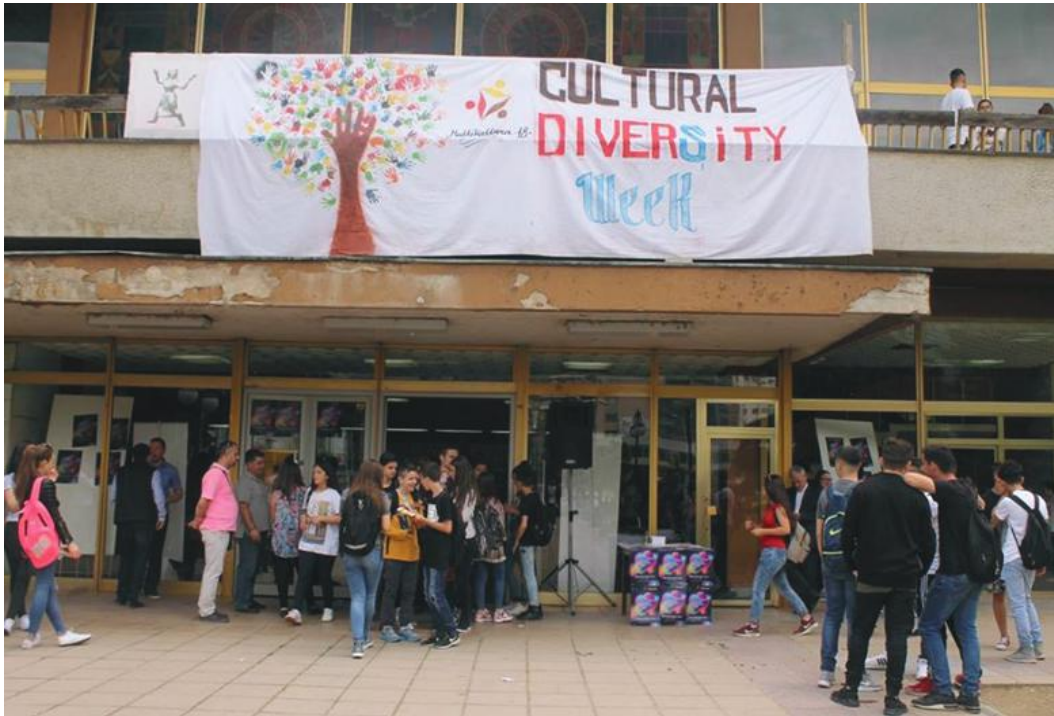
8th edition of Cultural Diversity Week, 2018