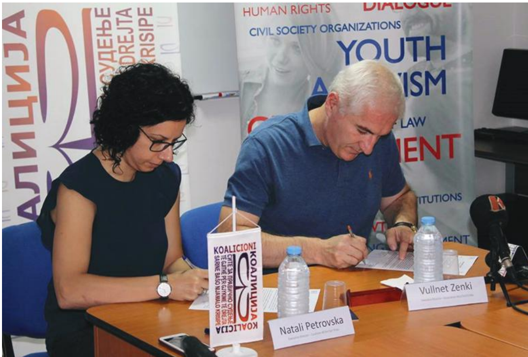
Became the new regional office for trial monitoring of CAFT