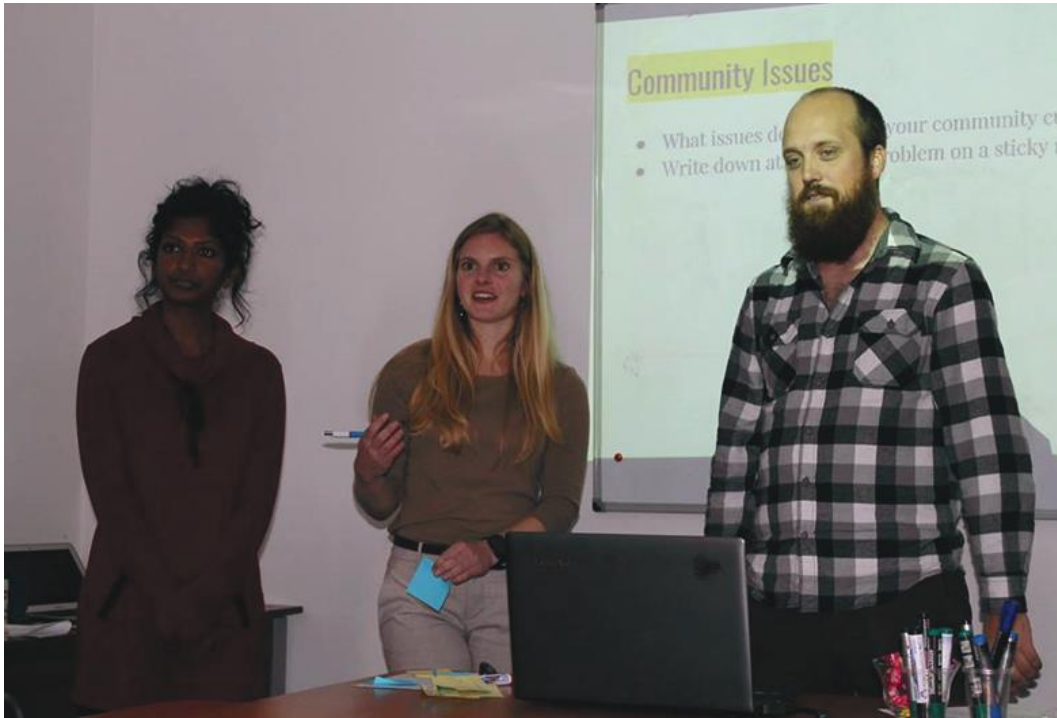
Workshop with Peace Corps Volunteers