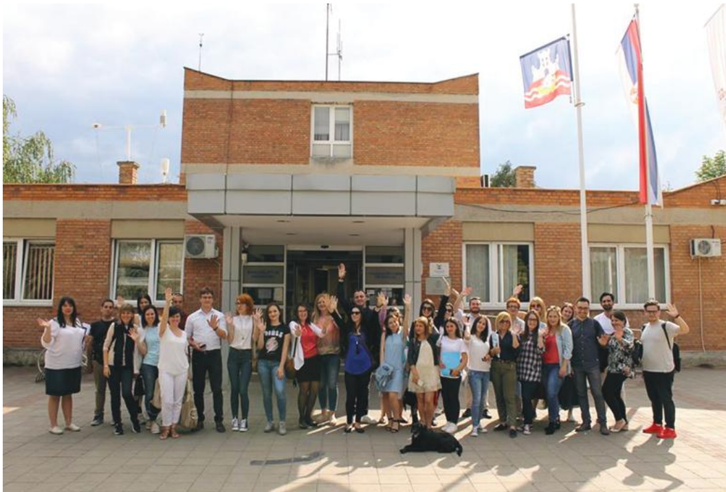
Study visit Youth Banks for Western Balkans and Turkey, Serbia