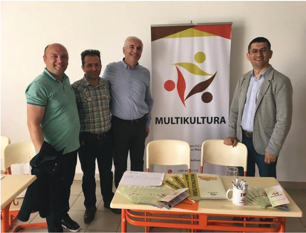
Career fair, organized by Career Center of South East European University