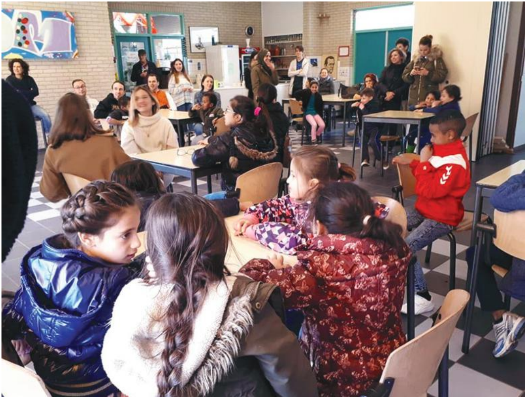
Study visit "Integration of young migrants in society", Netherlands