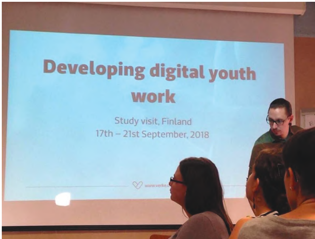
Study visit "Digital youth work", Finland