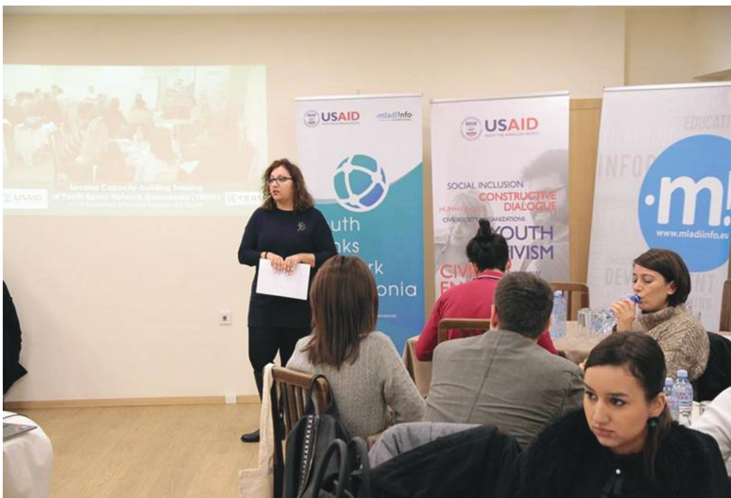
Multikultura becomes part of the Youth Banks Network Macedonia